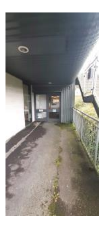
Indicative New Facility: